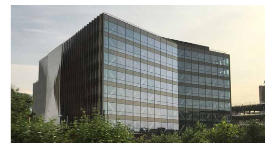
Forbury Place, Reading

Turkey (100% owned) – this operation has started to recover from the market challenges created by the fall in oil prices and currency decline, and the sequence of local and central government elections in 2014 and 2015. There have been a number of significant new commissions from NIDA Insaat, GE, Vodafone, Allianz Turkey, FIBA Gayrimenkul, Cengiz Insaat, Nurol GYO and Yuksel Insaat. The first half results do not yet reflect this recent success due to delays arising from ongoing changes to Municipality building regulations and due to a court ruling against developer choice on the use of zoning regulations from June 2015 which was subsequently over-ruled by the Government in February 2016. These events coupled with the continuing geo-political situation, saw our first quarter earnings stall. We have since recovered this position and expect to return the operation to a full year’s profit by the end of the second half. With GDP being forecast as one of the highest in Europe and our location within the commercial capital, Istanbul, we remain committed to this location.