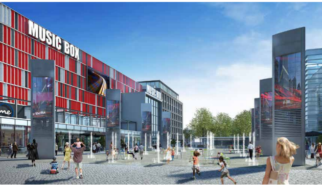
Mercedes Platz, Berlin