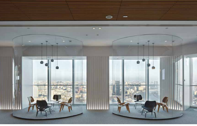
JTI, Moscow: Winner of Best Office Award 2016