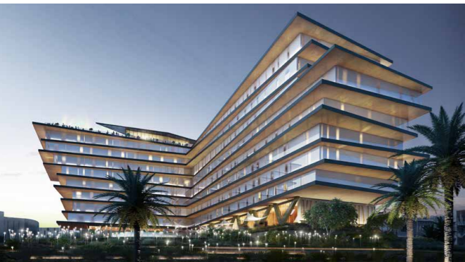
Yas Hotel, Abu Dhabi

Russia (100% owned) – significant management time has been spent on incrementally downsizing this operation since 2014, following the currency decline and imposition of international sanctions, which contained losses to a manageable level by the end of 2015. However, in H1 revenues fell by over 67% to £227,000 (2015: £692,000) which could not be mitigated by cost reductions alone and our losses widened to £118,000 (2015: loss £11,000) of which £44,000 is notionally recharged by the UK. Breakeven by the year end is unlikely and so we are re-structuring the business to a single corporate entity to remove any residual duplicated costs. On a brighter note the office won the Best Office Award 2016 with a design for Japan Tobacco International. This follows the Arcus III win in 2015.